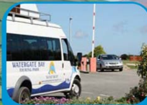
To the beach