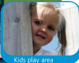
Kids play area