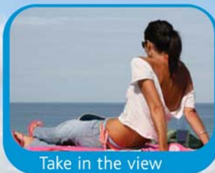
Take in the view