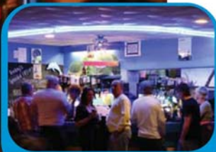
Relax in the evening