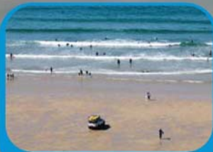
Surfing at Watergate